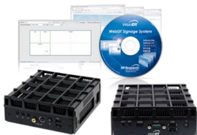
SA2000 and SA3200