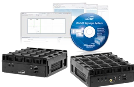
SA2000 and SA3000

Beijing Xingguang Film & TV Equipment Technologies